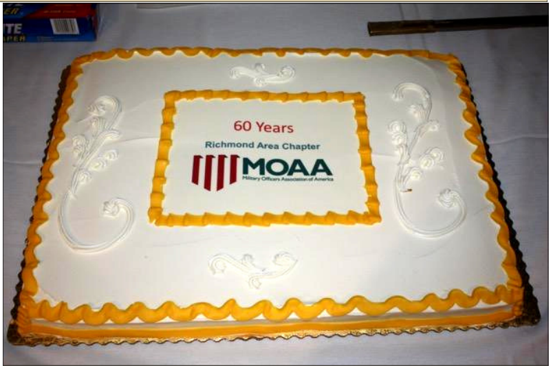
Our 60th Anniversary cake which was cut and served to all who attended the Holiday Gala